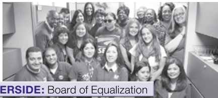
RIVERSIDE: Board of Equalization