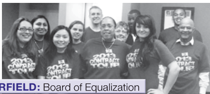
FAIRFIELD: Board of Equalization