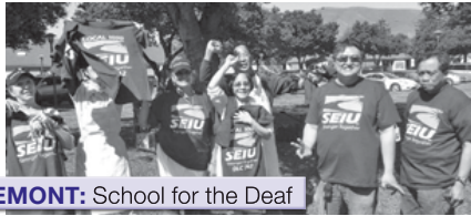
FREMONT: School for the Deaf