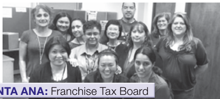
SANTA ANA: Franchise Tax Board