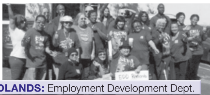
REDLANDS: Employment Development Dept.