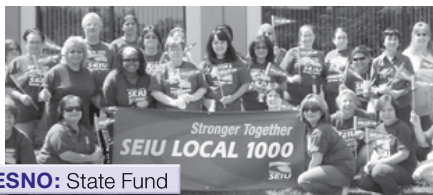
FRESNO: State Fund