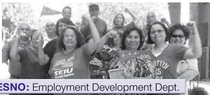
FRESNO: Employment Development Dept.