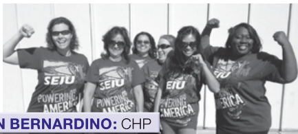
SAN BERNARDINO: CHP