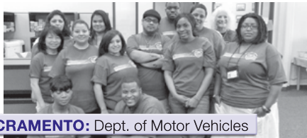
SACRAMENTO: Dept. of Motor Vehicles